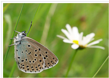
Large Blue underside