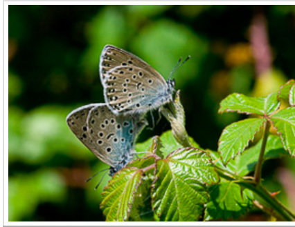
Large Blue mating pair, Collard Hill