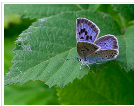
Large Blue female at Collard Hill

"At the time, there was no evidence to show that the application of the Butterfly Transect Method really did provide a direct correlation with population size."