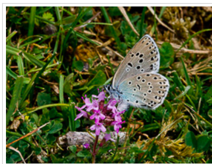
Large Blue egg-laying, Collard Hill

"On Dartmoor, where the National Trust managed the site for Large Blue, species like High Brown Fritillary, Pearl-bordered Fritillary, Small Pearl-bordered Fritillary, Dark Green Fritillary and Grayling, just to take the butterflies, have all increased and done better than the national trend."