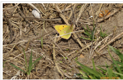
Clouded Yellow

A Clouded Yellow sighted at Southbourne Undercliff near Bournemouth on 4th December by Mike Gibbons. The microclimate on this very sheltered south-facing coastal site can often result in winter sightings of this species and it is also well positioned to receive early migrants from the continent. This was reported on UKB sightings forum here . Another Clouded Yellow (a male) was then photographed at the same site by Mike Gibbons on 29th December as reported here .