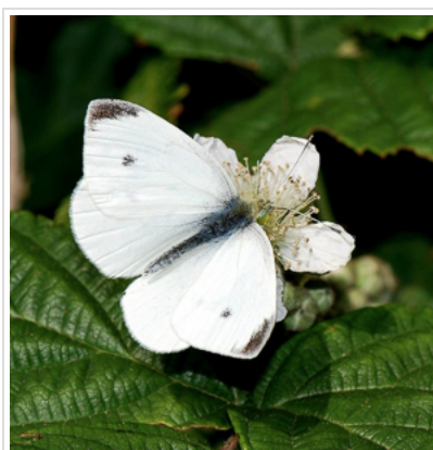
Small White (male)