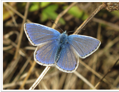
Common Blue