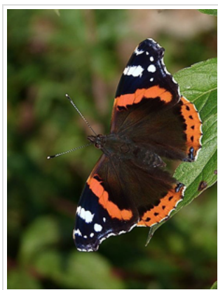
Red Admiral

There were quite a few sightings of Red Admiral (via Twitter) in the run up to Christmas and the New Year.