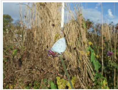
Holly Blue