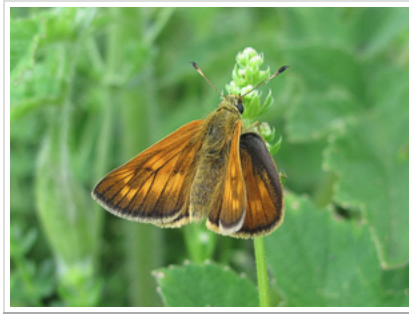
Large Skipper (female)