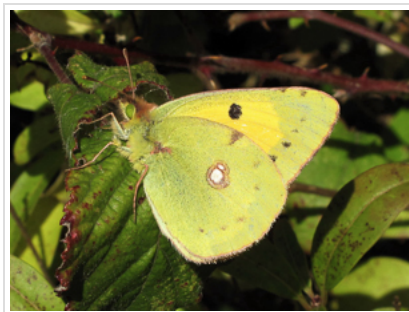
Clouded Yellow