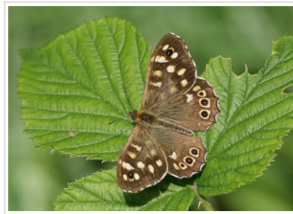
Speckled Wood ( Pararge aegeria ) male (Library Pic)