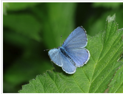
Holly Blue ( Celastrina argiolus) male (Library Pic)