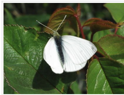
Small White ( Pieris rapae) male