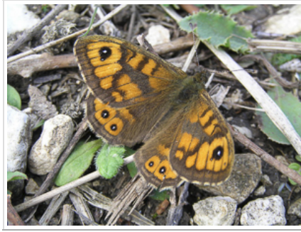
Wall ( Lasiommata megera ) male (Library Pic)