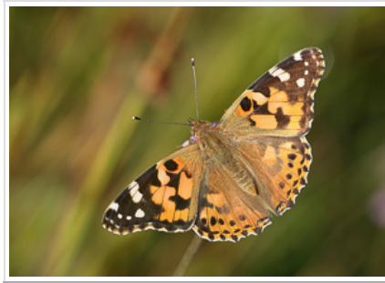
Painted Lady ( Vanessa cardui ) (Library Pic)