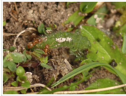
Common Blue ( Polyommatus icarus ) Larva

Pauline Richards recorded a fascinating series of images of ants plastering soil on a Common Blue larva at Noar Hill on 8th April in her personal diary .